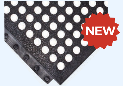
24/Seven® LockSafe® Open